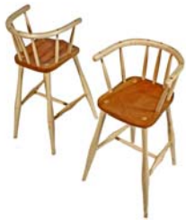
Child's high chair Make 2 per course